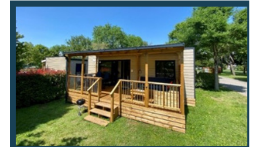
Stacaravans Estivo Premium Plus

Estivo travel LUXURY CAMPING HOLIDAYS Camping Pra delle Torri